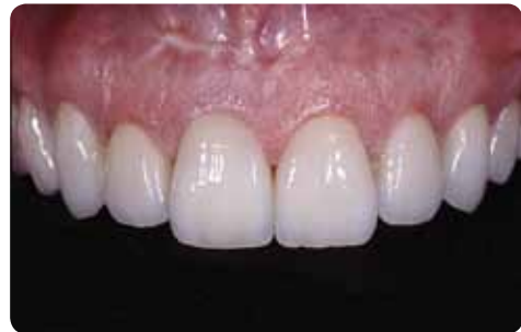
Complete dentures with IPS e.max Press Prof. Dr D. Edelhoff / O. Brix, Germany

Select, in cooperation with your laboratory, the suitable solution for the respective patient case: a cost-effective, fully contoured restoration as an economical and appealing alternative to a full cast crown. Or you can choose the more exclusive version fabricated by means of the cut-back and layering technique, which will meet even the most exacting esthetic requirements of your patients.